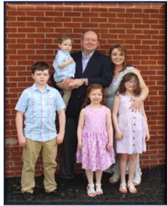
The Clark Family