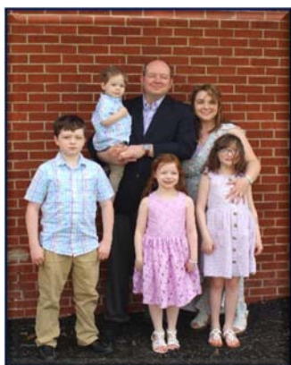
The Clark Family