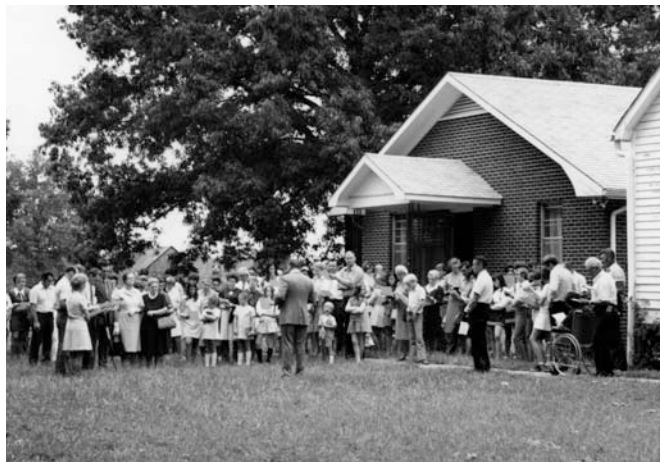
groundbreaking service for current building, 1972