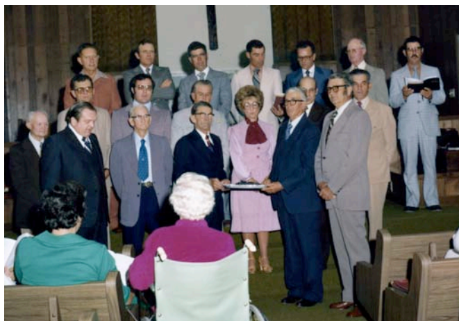
note burning ceremony, 1978