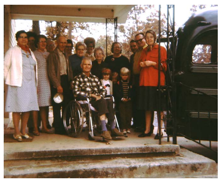
Senior citizen outing, fall 1972.