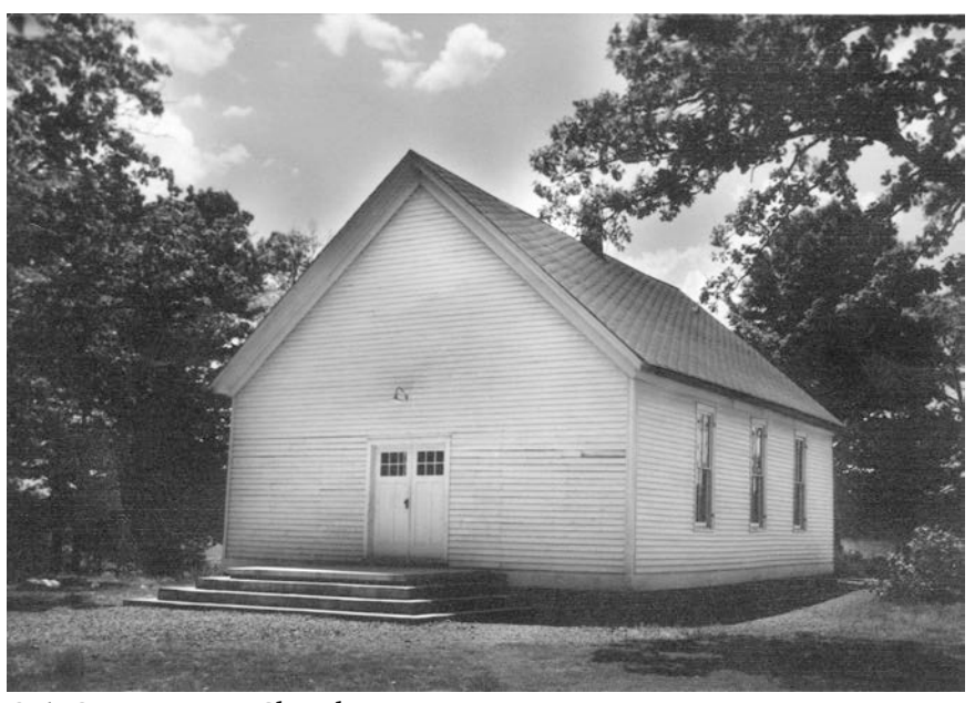
Oak Grove Baptist Church, 1947.