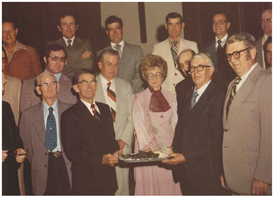
Note burning ceremony for current building, Oct. 29, 1978.