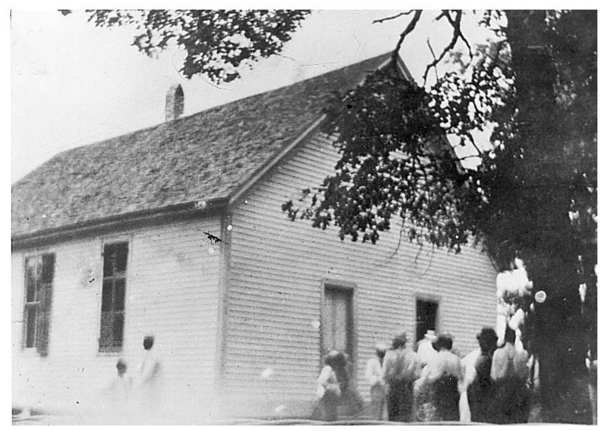
Oak Grove Baptist Church photo dated Aug. 11, 1919.