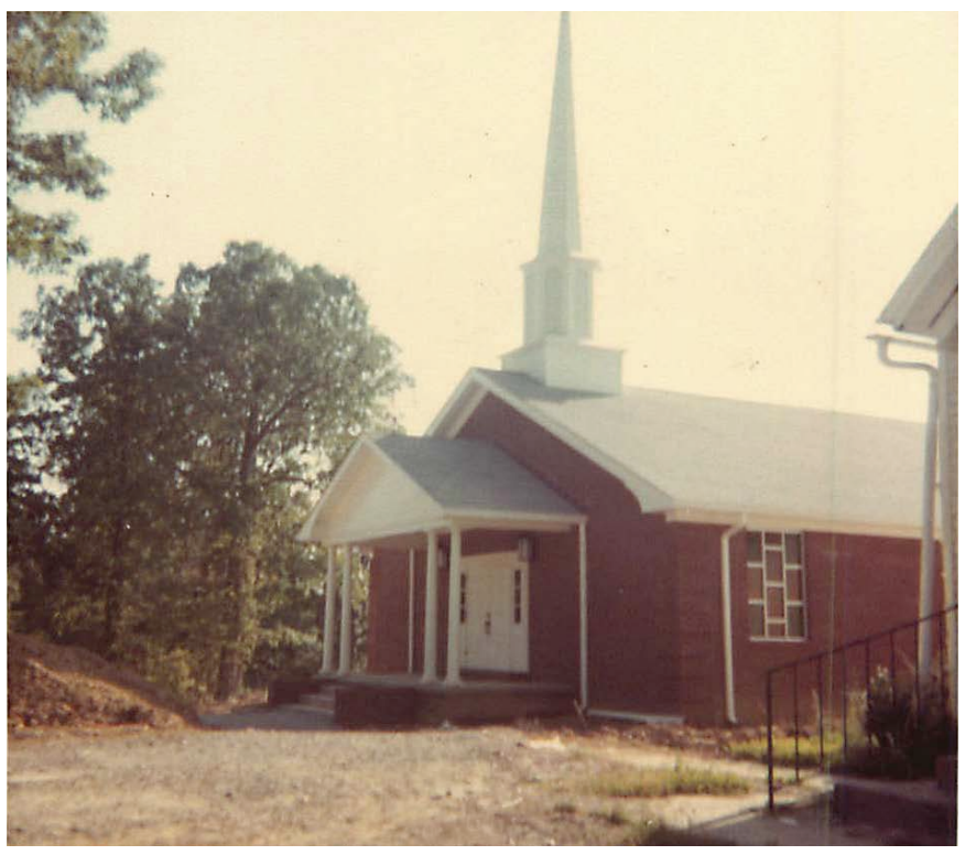
Current building, Aug. 1973.