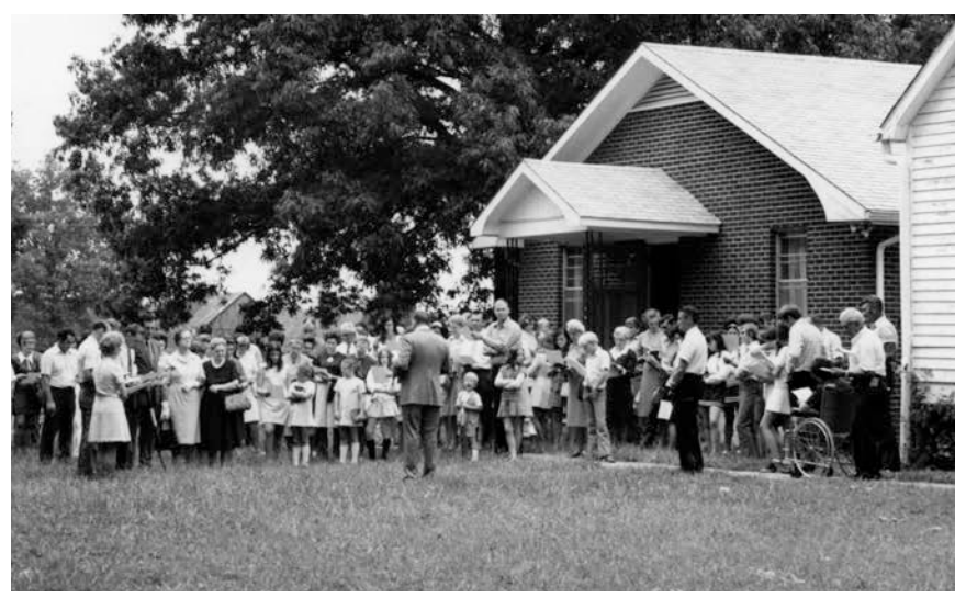
1972 groundbreaking service.